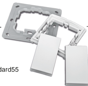
← EHAK02 Installation Kit for Radio Button