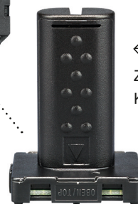
← ZF AFZM-0001 KNX Pairing Adapter