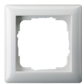
← 1-gang Cover Frame Gira Standard55