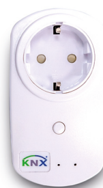
← MDT RF-AKK1ST.01 KNX RF Socket

The KNX RF Interface enables communication with KNX RF devices and thus, enables wireless programming via KNX RF media couplers. With the KNX RF radio-controlled socket, wireless switching functions can be performed without danger of touching live parts.