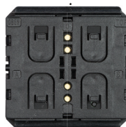
← ZF AFIM-1010 KNX-RF RF Push Button Module